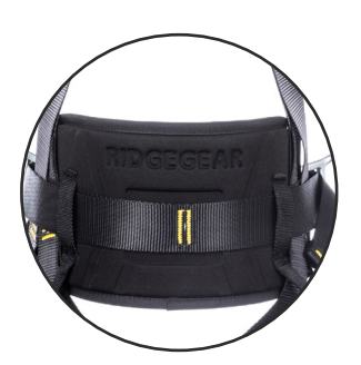
Work positioning . belt