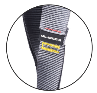
Rip stitch indicators