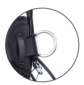
Fold back D rings