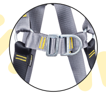
Front & rear attachment point