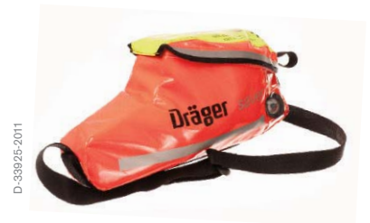
Dräger Saver CF – soft bag

The SE version includes a newly developed elastic neck seal which offers unparalleled resistance to the effects of high temperatures, ozone and diesel fumes, which are often found in places such as engine rooms. This translates to years of reliable, worry-free service, even under adverse conditions. Standard Dräger Saver CF15 units can also be retrofitted with the SE option.