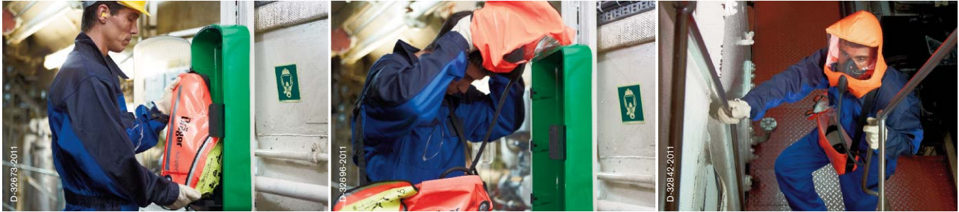
Dräger Saver CF soft bag