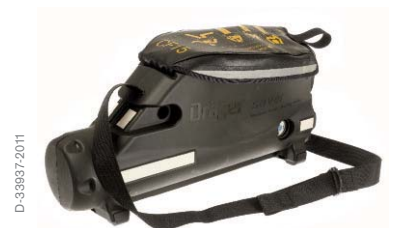
Dräger Saver CF – hard case