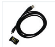
IR connectivity kit